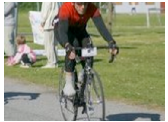
Racing for the finish.

between Denmark and Sweden in the qualifying series preceding the European Championships. Denmark had evened a 3-0 deficit to 3-3 when the referee blew the whistle as a Danish player gave a Swede a punch in solar plexus inside the Danish goal zone. Red card and penalty shot was the obvious consequence. This caused a spectator, a Dane living in Sweden (sic!), to go over the top and enter the field delivering a punch in the face of the referee and attempting to have another go when stopped by Danish players. The referee stopped the match and proclaimed Sweden as a winner with 3-0. This capped everyone's mood for an hour or so. Soon the race itself prevailed and it was a fantastic race indeed. Next race starts May 31 and ends June 1 in 2008.